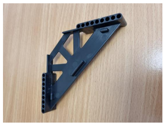
Stacking corners M10 Article: 15429