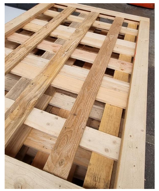
Palette M10 V2 Artikel: 15069